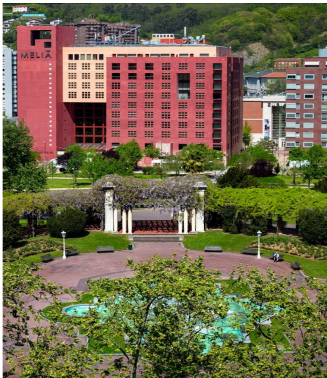
Hotel Meliá Bilbao Lehendakari Leizaola 29, Bilbao Tel: (34) 94 428 0000 melia.bilbao@melia.com Check-in 15:00 /Check-out 12:00